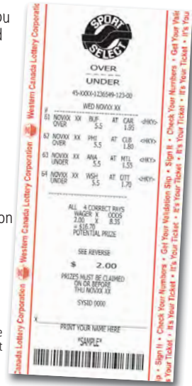
Sample OVER/UNDER ticket

IMPORTANT: For OVER/UNDER, final Hockey results are at the end of regulation play; final Soccer results are at the end of regulation play including injury time. Both sports do not include overtime or shootouts.