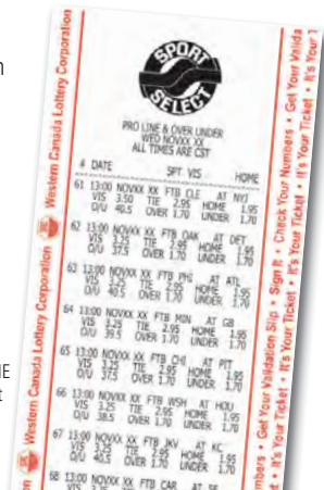
Sample PRO•LINE game list