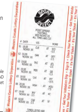
Sample POINT SPREAD ticket

For all sports except Hockey, final POINT SPREAD results include all extra play. For Hockey, final POINT SPREAD results end at regulation play.