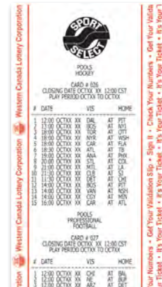
Sample POOLS card

HOW DO TIES WORK ON POOLS? Final outcomes for POOLS include all extra play (i.e. overtime, shootouts, extra innings, etc). If a tie occurs in a game, both outcomes are considered correct.